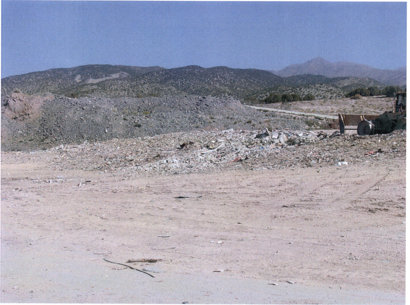
Looking north at the working face