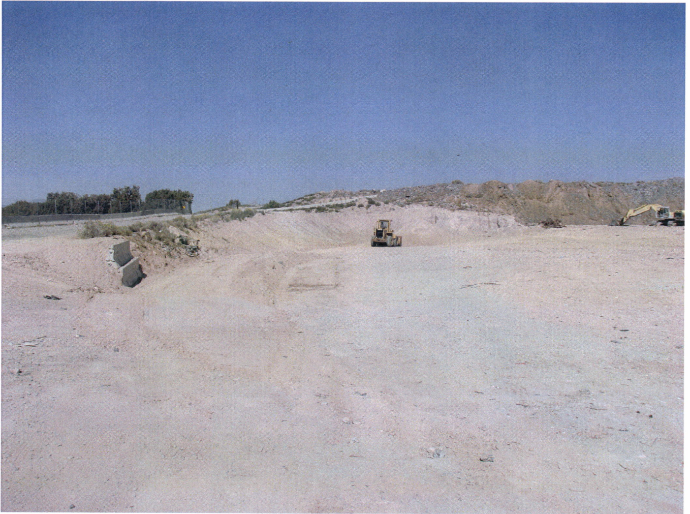
Looking northwest at the west side of the landfill. This area is being prepared for landfilling during the winter months.